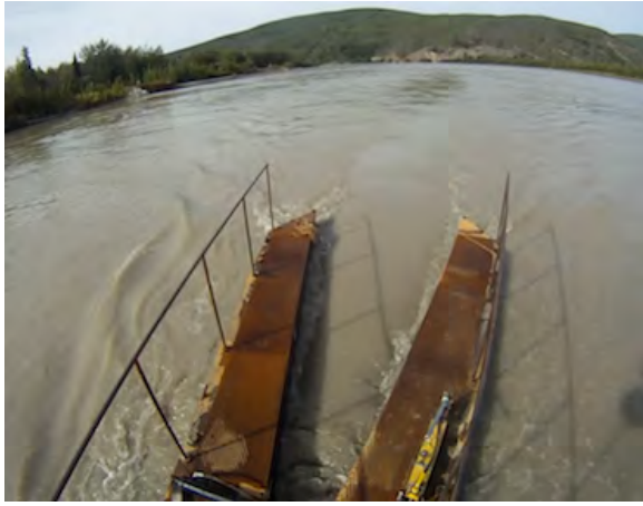
FIGURE 4. DOWNSTREAM VIEW OF TURBULENCE GENERATED FROM THE RDDP.

The results shown in Figure 5 indicate that natural turbulence from the river produced voltage fluctuations of about 150 W at a downstream distance of 100m. This is about 1% of the mean power at 100 m. The results of Figure 5 and Table 1 indicate that turbulence generated by the RDDP may have reduced the mean power output of the OCEANA turbine by about 8.3%.