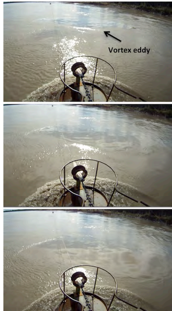
FIGURE 3. VORTEX EDDY (~3-M DIAMETER) MOVING DOWNSTREAM AT THE TRTS VIEWED FROM THE FRONT OF THE RDDP.

To determine if turbulence from the RDDP influences turbine performance the turbine was operated at a downstream distance of