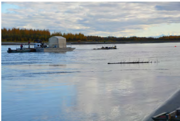
FIGURE 1. AHERC TEST BARGE WITH OCEANA REC ON DECK MOORED BEHIND THE RDDP WITH A DEBRIS OBJECT FLOATING BY.

During summer 2014, the Alaska Hydrokinetic Energy Research Center (AHERC) and OCEANA Energy Company (OCEANA) conducted performance tests on OCEANA's river energy converter (REC) at the Tanana River Test Site (TRTS). OCEANA's REC was deployed from AHERC's test barge moored immediately downstream from AHERC's research debris diversion platform (RDDP), which was moored to a midstream buoy attached to an embedment anchor (Figure 1).