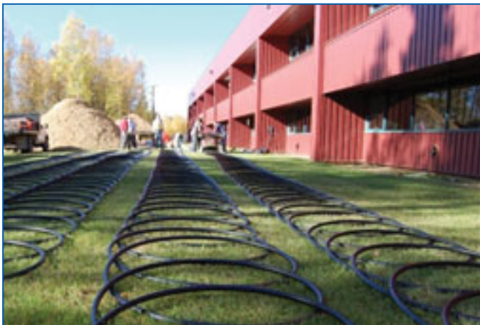
Ground loops await installation at Weller Elementary School in Fairbanks.

Within the U.S., the South has the highest percentage of GSHP installations (35%), followed by the Midwest (34%), the Northeast (20%) and the West (11%). Ground-source heat pumps in the U.S. are typically sized for the cooling load. This sizing is in contrast to GSHPs in Alaska and other northern areas, where the capacity of a GSHP is determined by the heating load of the building. Furthermore, in cold climates it is probable that a GSHP will be used only for heating, whereas in more moderate climates the ground is used for both heat extraction (space heating) and rejection (space cooling). This difference presents two disadvantages for GSHP efficiency in cold climates: heat is being extracted from relatively cold ground and it is not being balanced by heat rejection used for space cooling.